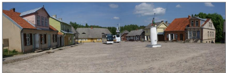
Rumšiškės Museum Market Square, 2017

As of 1988, the Open-Air Museum of Lithuania was a collection of farm homes, out-buildings and other structures that one might have found on farmsteads in the five different ethnographic regions of