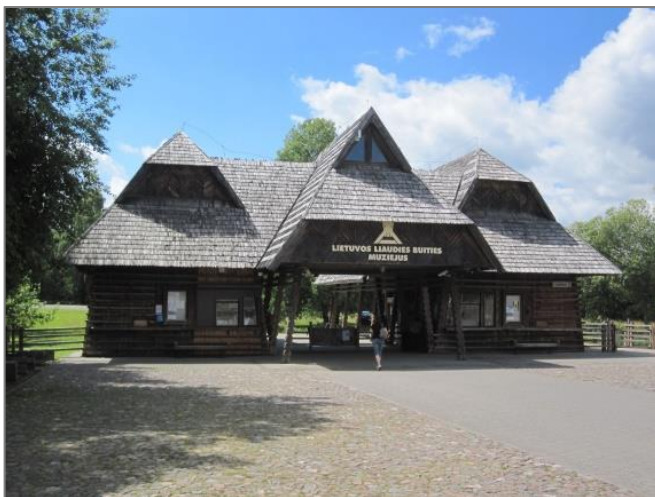
Rumsiskes Museum Entrance, 2018