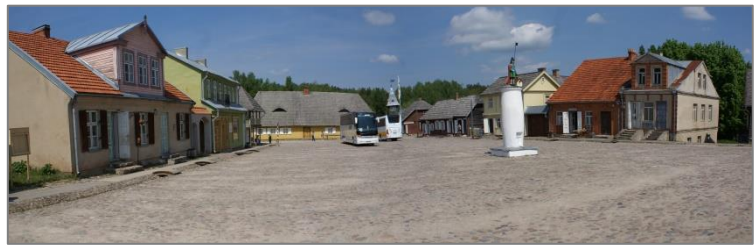
Rumsiskes Museum Market Square, 2017

As of 1988, the Open-Air Museum of Lithuania was a collection of farm homes, out-buildings and other structures that one might have found on farmsteads in various parts of Lithuania. As groups, these formed tiny hamlets. There was no re-creation of a central “town” or a typical “market square.” There was no mention, in 1988, of a Jewish minority population in pre-World War I Lithuania. This may have been appropriate, because on the farms there were very few Jews.